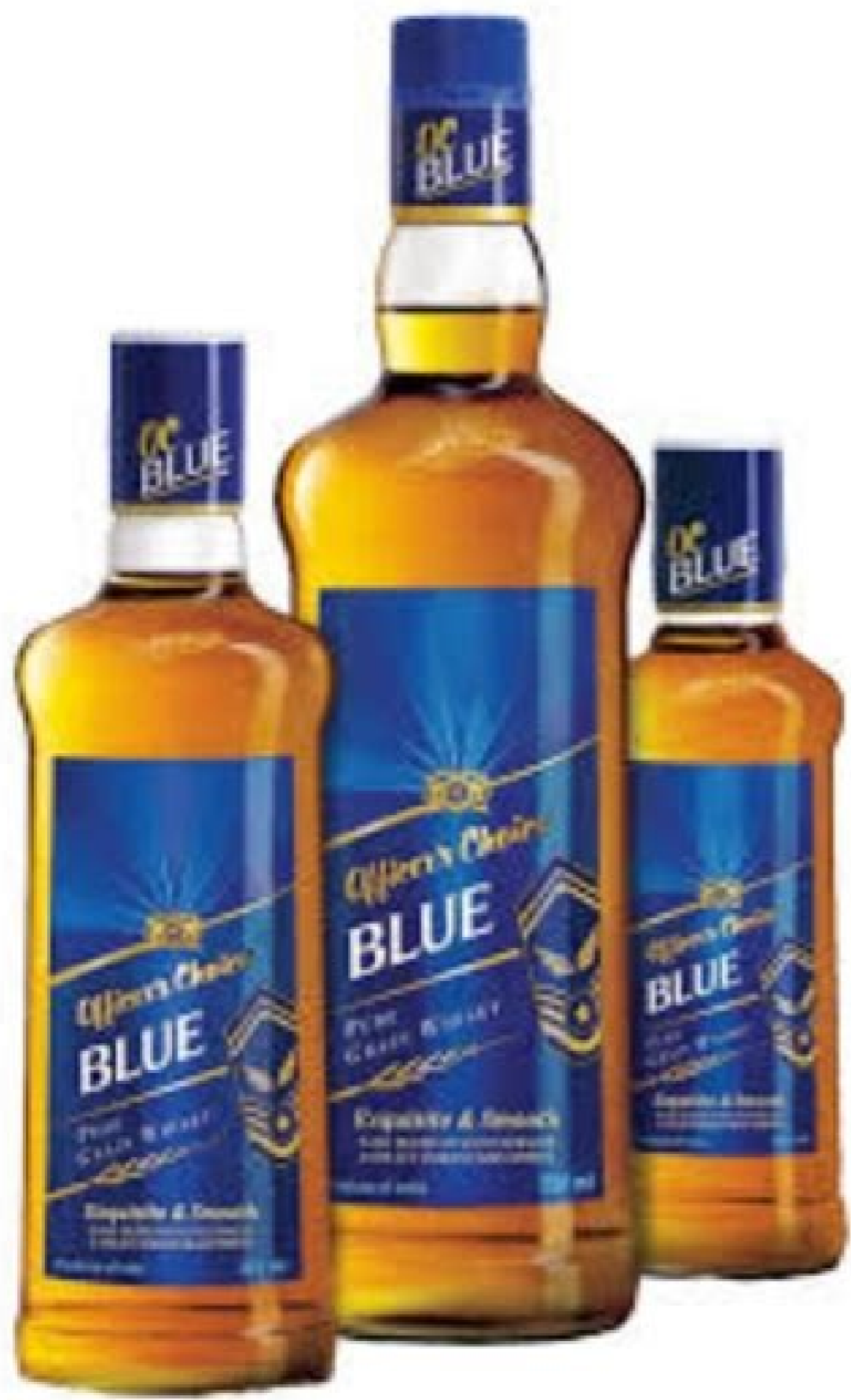
Updated Price List