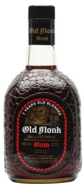
Price List -2020